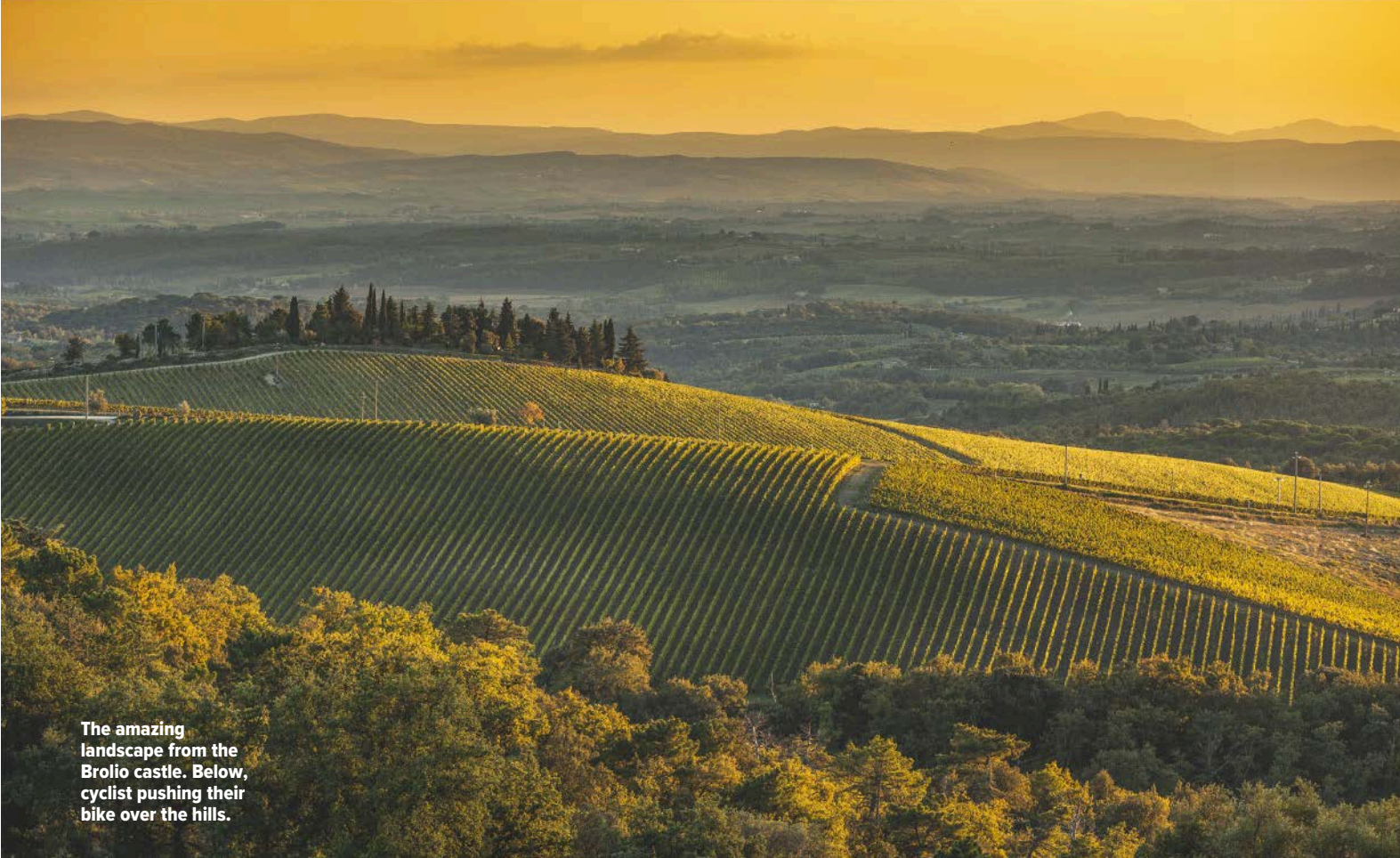
The amazing landscape from the Brolio castle. Below, cyclist pushing their bike over the hills.